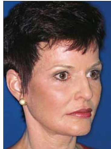
Multiple procedures were performed on this patient including an endoscopic brow lift, upper eyelid surgery, a neck lift, chin implant, and laser skin resurfacing.

expressions after treatment? Yes! Unlike how it is portrayed in Hollywood spoofs and movies, BOTOX® Cosmetic will not prevent you from smiling, frowning, or any other expression. You still will be able to—just without the wrinkles and creases between your brows.